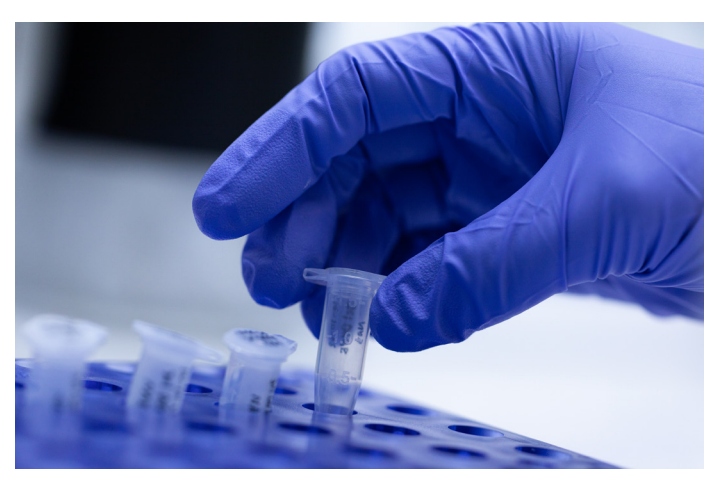
Results are reported as positive or negative with a positive result indicating the presence of SARS-CoV-2 genetic material.