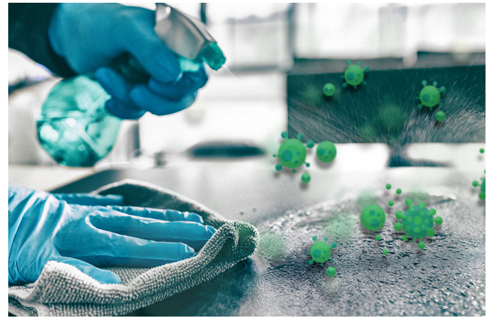
High-touch surfaces in common areas of your facilities may play a role in transmission of COVID-19.

The ALS test for SARS-CoV-2 uses a molecular diagnostic assay that detects the presence of viral ribonucleic acid (RNA) that is unique to the virus. This gold standard test is closely modeled after clinical testing protocols recommended by the US CDC, but modified for the testing of environmental surface swabs. The test involves the amplification of targeted viral RNA by a process called Reverse Transcription Polymerase Chain Reaction (RT-PCR).