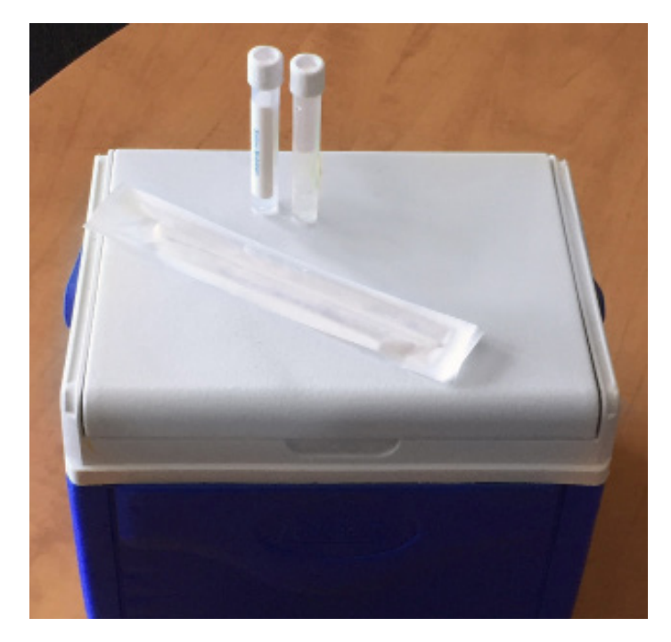
Sampling kits contain everything needed to collect surface swab samples.

Please contact ALS Winnipeg or any ALS Canada main location for additional guidance, and to arrange for provision of sample test kits.